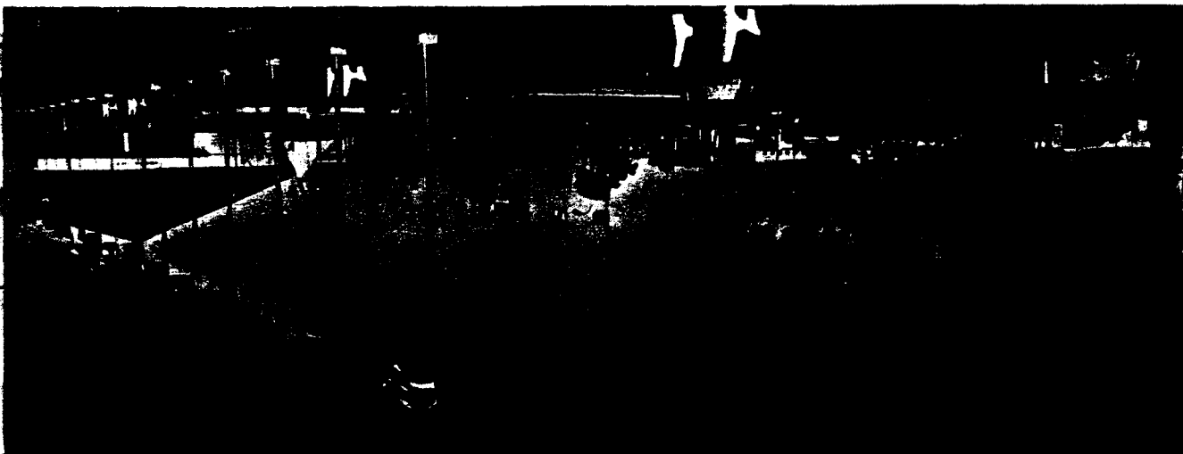
BICENTENNIAL FLAG PAVILION - JACKSONVILLE BEACH, FLORIDA, U.S.A.