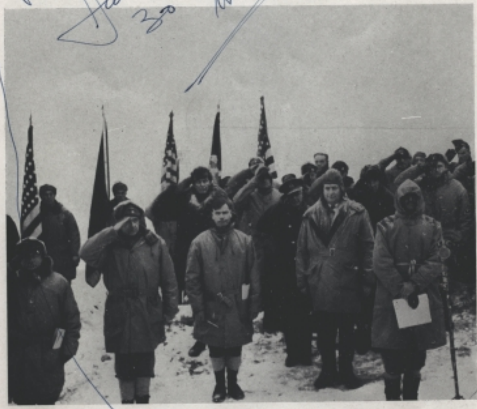
OFFICIAL OPENING, NOVEMBER 20th, 1942