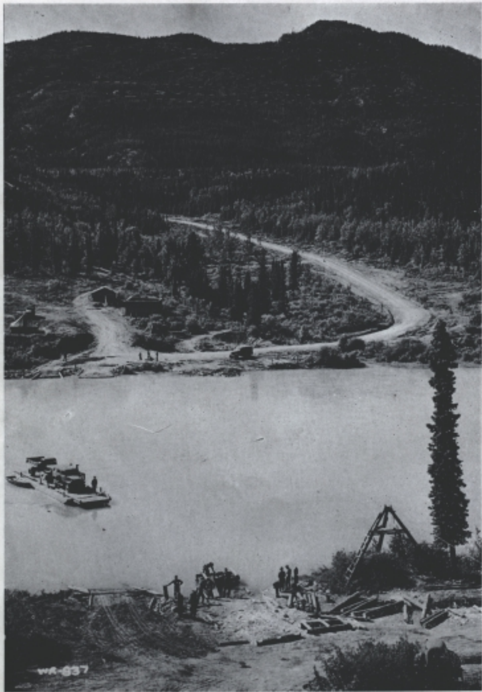
ROLLING HILLS, DENSELY WOODED